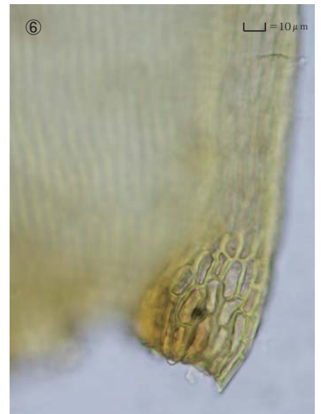
① ② ③ Plant. ④ Cells at apex of stem leaf. ⑤ Median laminal cells of stem leaf. ⑥ Cells at base of stem leaf.