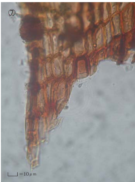
① Label. ② Plants. ③ Fertile plant. ④ A leaf. ⑤ Cells at apex of leaf. ⑥ Median laminal cells. ⑦ Cells at base of leaf.