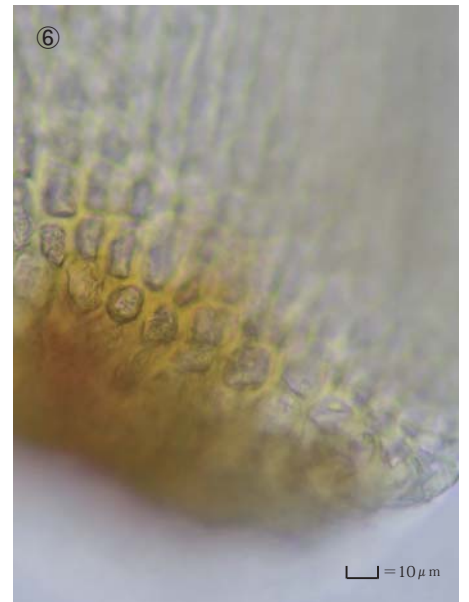
① ② ③ Stem leaf. ④ Cells at apex of stem leaf. ⑤ Median laminal cells of stem leaf. ⑥ Cells at base of stem leaf.