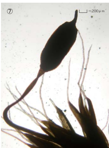
① Label. ② Plants. ③ Plant. ④ Leaves. ⑤ Cells at apex of leaf. ⑥ Cells at base of leaf. ⑦ Plant with a capsule.