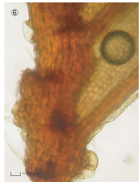
① Label Branch leaf ② Plants. ③ Plant. ④ Cells at apex of leaf. ⑤ Median laminal cells of leaf. ⑥ Axillary hyaline nodules.