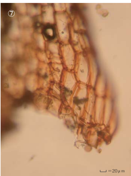
① Specimen label. ② Plants. ③ Capsule. ④ A leaf. ⑤ Cells at apex of leaf. ⑥ Median laminal cells of leaf. ⑦ Cells at base of leaf.